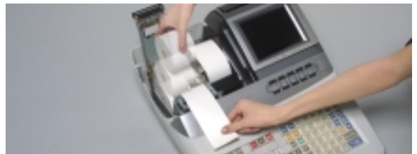
• Drop-in paper-loading for quick, easy paper roll changes