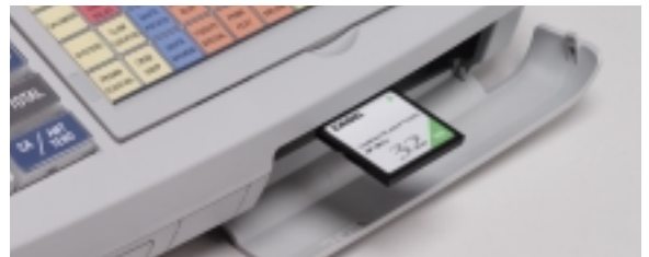
• CF card interface for fast, simple data transfer